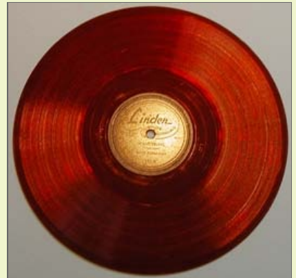
A typical red vinyl Linden disc (No. 163), ca. 1953