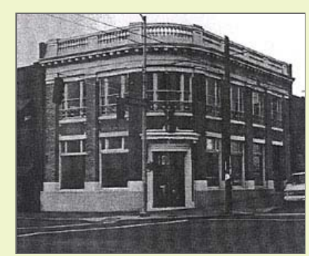
Former site of Linden Records Broadway and Pike, Seattle, n.d.